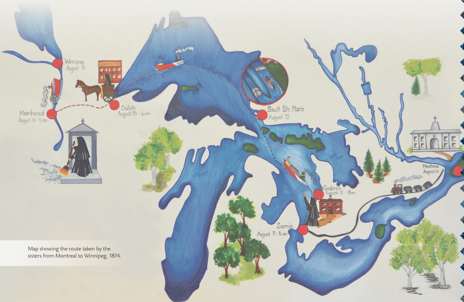
Map showing the route taken by the sisters from Montreal to Winnipeg, 1874.