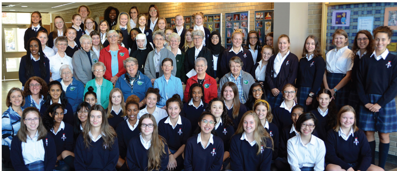
Sisters with students during Mother Marie-Rose Week in October 2018