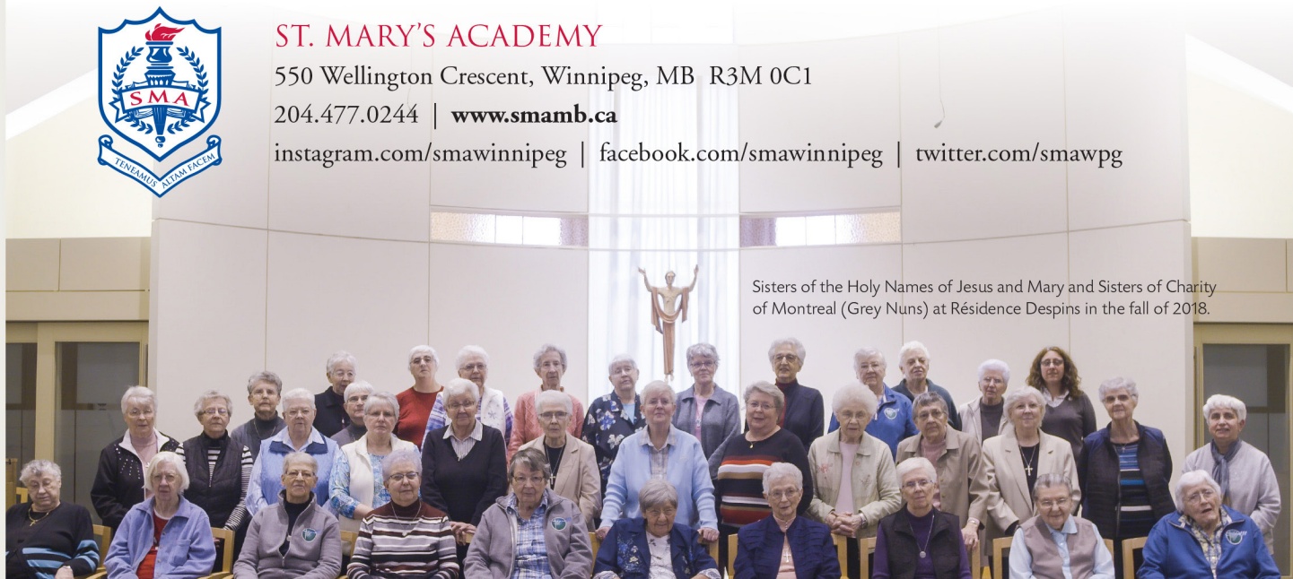
Sisters of the Holy Names of Jesus and Mary and Sisters of Charity of Montreal (Grey Nuns) at Résidence Despins in the fall of 2018.

instagram.com/smawinnipeg | facebook.com/smawinnipeg | twitter.com/smawpg