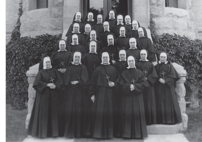
Sisters of the Holy Names of Jesus and Mary on the steps of St. Mary’s Academy in 1915

Many hands were required to meet the needs of the Sisters and the students. In addition to serving as teachers, many of the Sisters were housekeepers, cooks, infirmarians and laundresses. Still others supervised boarders or taught private music and art lessons.