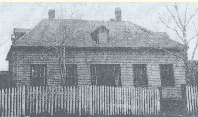
Maison Ste Marie (St. Mary's Academy)