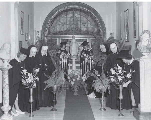
Sisters with college graduates in 1949

From the humblest of beginnings in 1869, to its 150th anniversary in 2019, St. Mary's Academy's nurturing of young women in spirit, mind and body has challenged each student to reach her full potential as an individual created in God's image, and to live her life true to the Academy's motto, HOLD HIGH THE TORCH (TENEAMUS ALTAM FACEM).